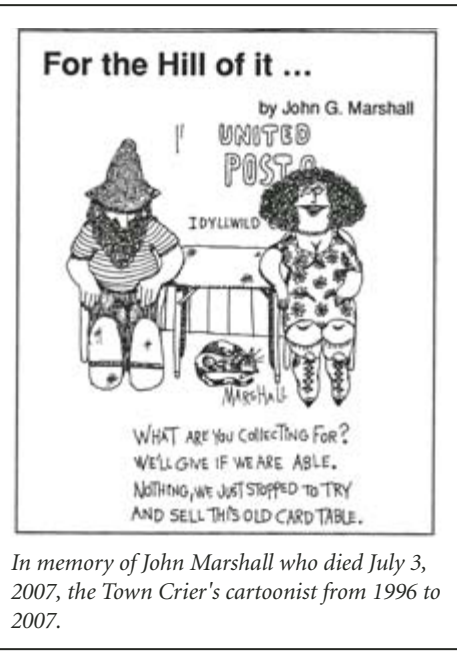
In memory of John Marshall who died July 3, 2007, the Town Crier's cartoonist from 1996 to 2007.

meat — in both the cruelty inflicted on them while they are being raised for these products and in the pain and terror they feel when being killed for them. Quitting animal products also makes it more likely that starving people all over the world can be fed, because water and grain can be used to feed them, rather than feeding animals who will be killed for meat. And raising and killing animals to eat their products and their bodies is a huge polluter of our air See Letters, next page